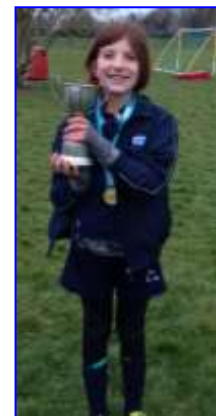
With 2 pools of 5