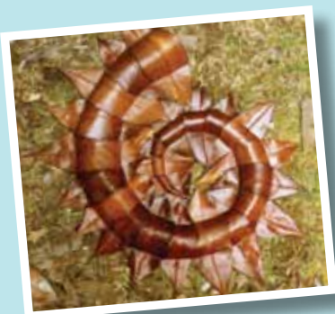
Leaves polished and greased, pinned to the ground with thorns.

Why don't you try making one next time you visit the coast?