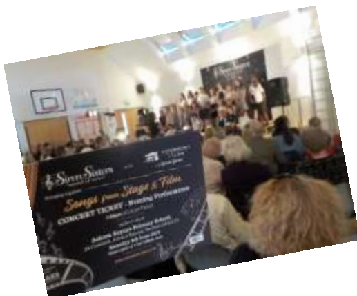
The AK school choir