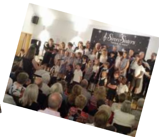
The AK school choir with the Siren Sisters and the AK 47s