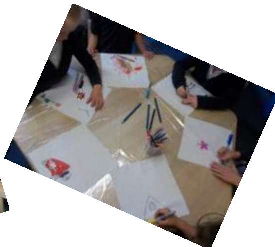
Putting the design on the cloth for the beeswax wrap.