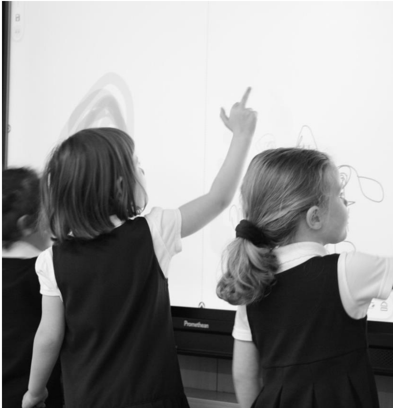
Bespoke Daily Phonics Scheme with reading books directly linked